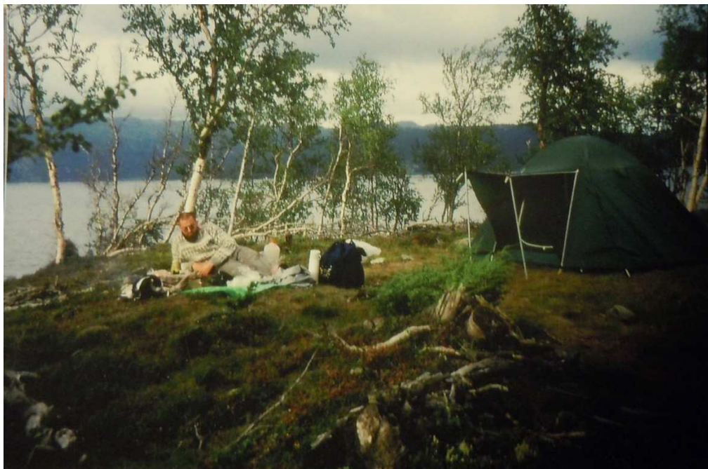
Up in the mountains at Hallingskarvet close to Strandavatnet. 1992