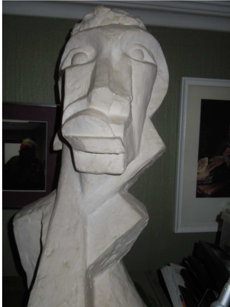
A cubism figure which he created.