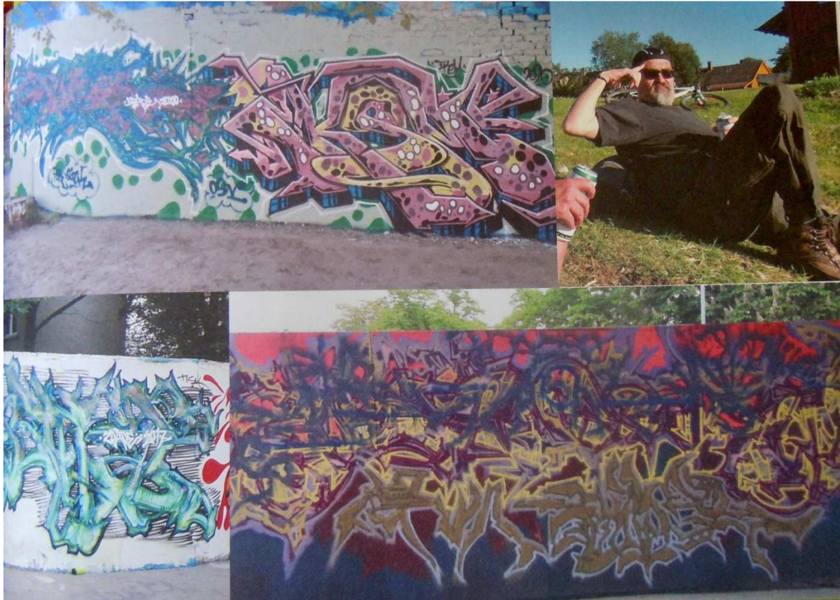
SOME OF THE ILLUSTRATIONS FROM THE BOOK